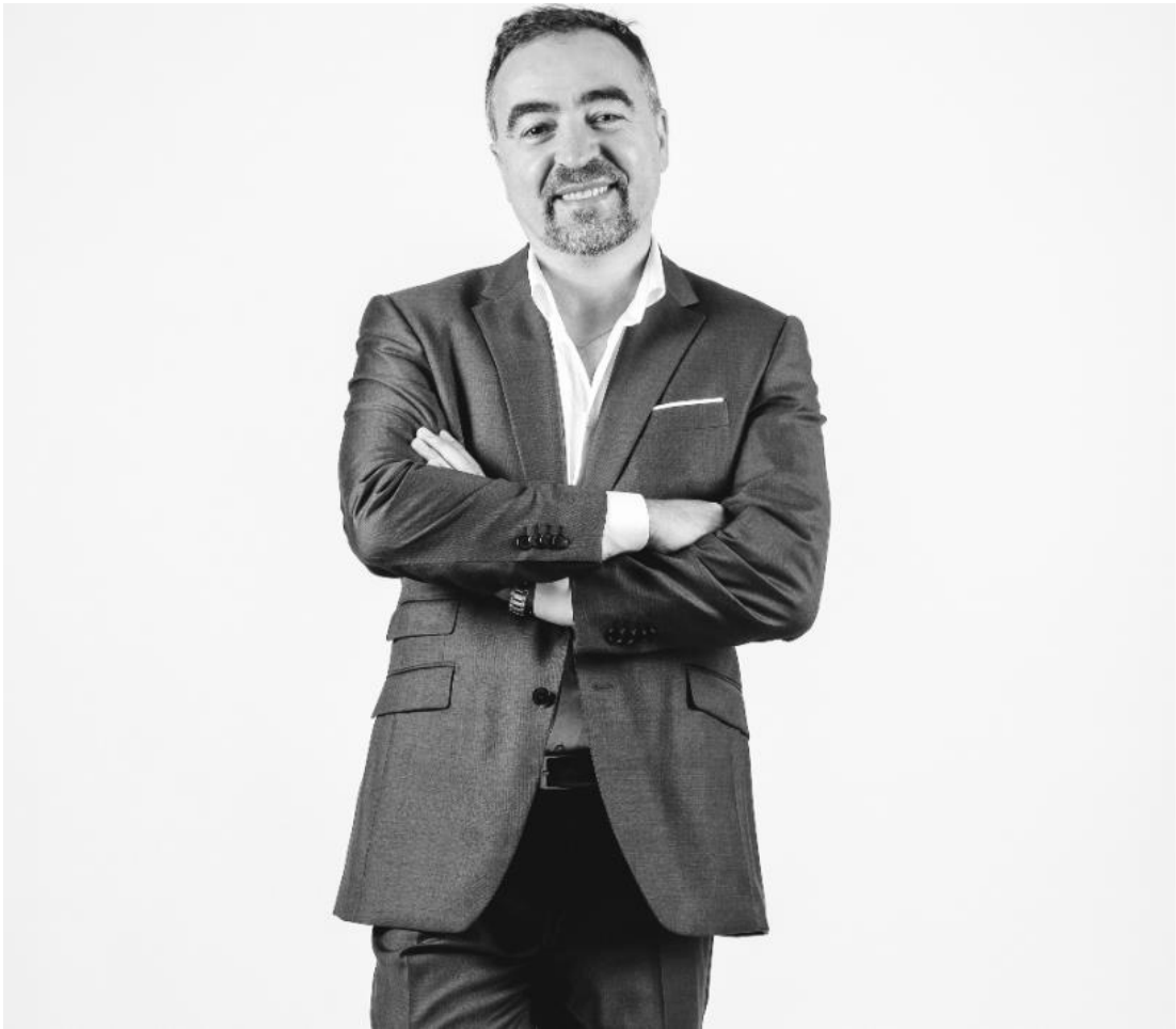
— Xavier Cartron

Cartron comments: "The design showcases a strong Emirati identity by the way of overall harmony of colours, like a shade of ivory, beige (reminiscent of the sandy beaches of the Persian golf course), of ochre yellow (inspired by the desert of the peninsula), and finally different shades of blue initiated by the turquoise waters of Abu Dhabi. Not just this, but also, in the use of ornaments inspired by the whole culture of the Arab world, these arabesques are the visual expression of decoration. This design was based on classical proportions structuring the overall proportions of the project." The Palace of the Nation opened its door for the general public in March 2019, and it has become a monumental landmark for the country. Designing such a big project was not an easy task, but Cartron knew what the client wanted. For Cartron, client's brief holds utmost importance. He shares: "I am passionate about my work whatever the project, any style, any scale. I don't care about my signature, on the contrary, I like variety. I do not try to adapt the projects to my design; I prefer to adapt my design to the project. Listening and understanding the scope of the client is the key to my success and is one of the reasons for the plurality of our projects. I take inspiration from the relationship I have with my clients. It is essential to understand their request to start working."